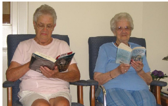
Sit back, relax, and read.